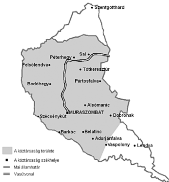
Map 4. Porabje (Szentgotthárd county) and Prekmurje marking out the territory of the Republic of Mur.