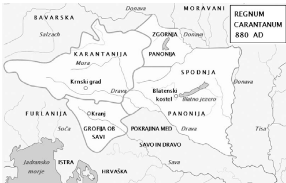
Map 3. Slavic Principalities constituting the Kingdom of Carantania (the year 880) 15