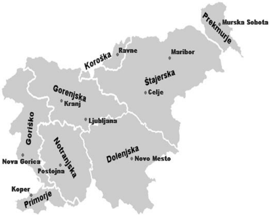
Map 2. Historical-geographical lands of Slovenia.

Source: Survey: Kakšno razdelitev na pokrajine si Slovenci želimo? "Večer" 18th May 2008.