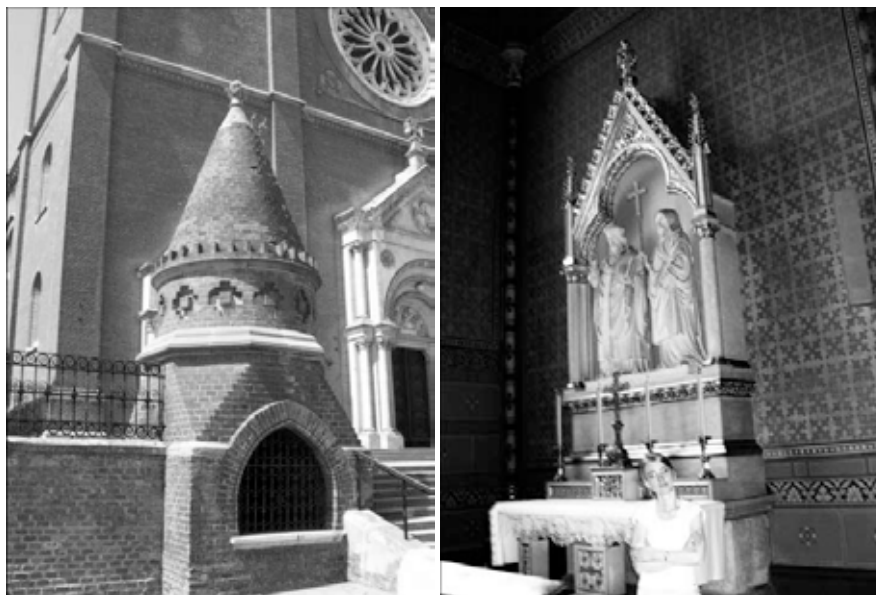
Photography 1, 2. Saint Peter's Catholic Cathedral in Đakov: the main entrance and the altar with the statues of Saints Cyril and Methodius.