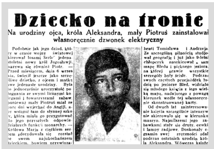
5. Fragment of an article on the then 11-year-old King Peter II; after: "Dziecko na tronie", Głos Poranny. Dziennik Polityczny, Społeczny i Literacki , 282 (12 October 1934), p. 2.