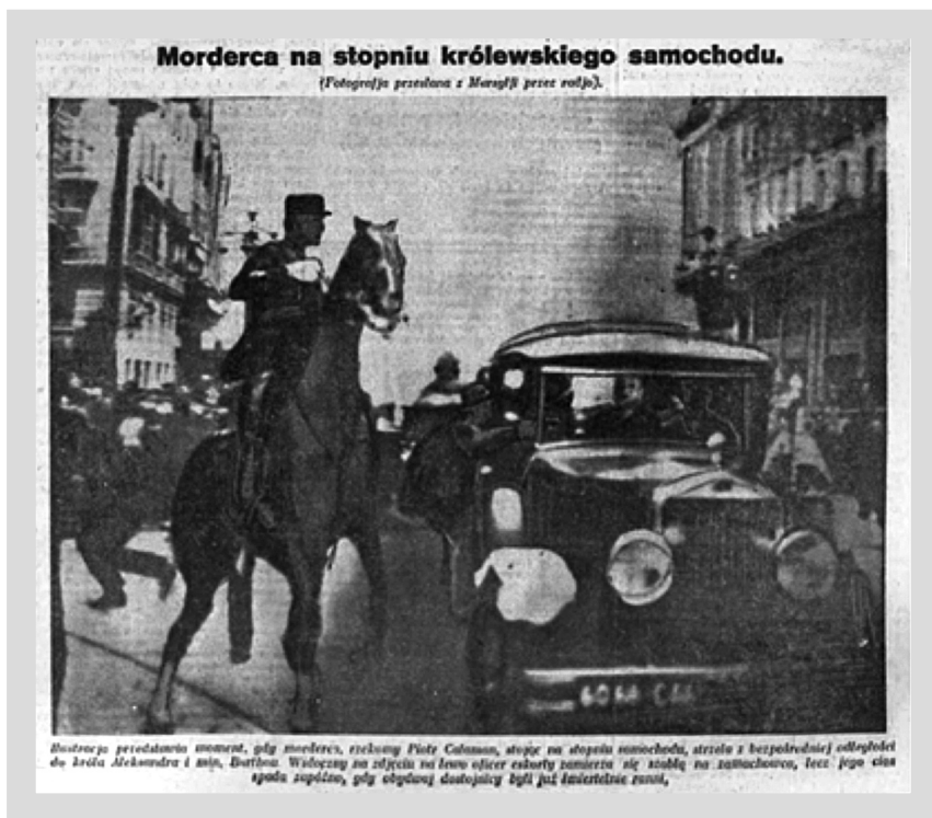
3. Photo of the moment of the attack in Marseilles; after: "Tajemnica spisku na króla Aleksandra i min. Barthou", Ilustrowany Kuryer Codzienny , 283 (12 October 1934), p. 1.