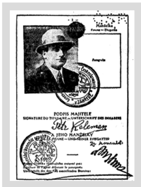
2. One of the pages of the fake passport used by Vlado Chernozemski; after: “Марсељска трагедија у свима својим узбудљивим и тешким појединостима”, Политика , 9486 (14 October 1934), p. 6.