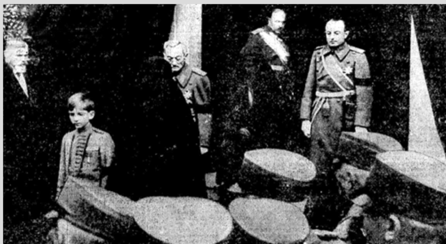
4. Meaningful photo taken at King Alexander's funeral; left to right: Peter II, heir to the throne, with his mother dressed in black, Prince Arsen, paternal uncle of the murdered monarch, and Arsen's son, Regent-Prince Paul, cousin of King Alexander I and de facto leader of the Kingdom of Yugoslavia after the latter's death; after: "Престоница и душа Југославије, Београд, велики у своме болу, опростио це јуче са својим витешким краљем ујединитељем", Политика , 9491 (19 October 1934), p. 1.

surrounded by chevaliers of the Order of Karađorđe's Star and clergymen, patriarchs and bishops of other denominations. The presence of one more participant was particularly moving: the monarch's favourite horse led by two royal guards. Behind the stallion, the supreme commanders of the Yugoslav Army were carrying the royal insignia. Next were about thirty slowly rolling cars carrying wreaths from the people and officials, finally followed by the modest coffin with the remains of the king, drawn by a team of four horses. Behind the coffin walked the monarch's son, Peter, wearing a Yugoslav Falcon outfit, his mother, Queen Maria, and all members of the Karađorđević family, followed by delegates of foreign states, and then – masses of Yugoslav citizens. 88